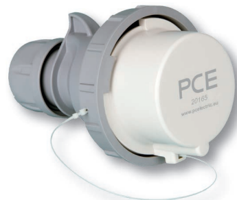
0152-6TT + 20165